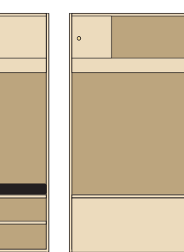
Lower Storage Bin w/ Flip-top Storage Seat